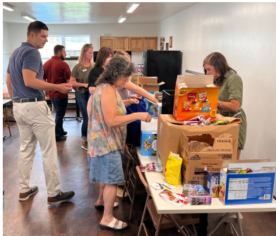
BNI Peak Referrals Chapter helping at the Resource Center.