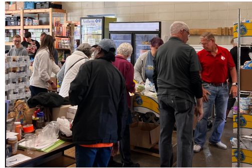
The Honorable Order of Kentucky Colonels helping at the Food Pantry.